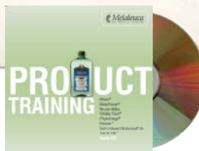
Product Training Audio CD