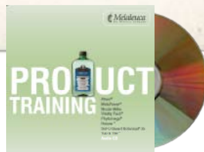
Product Training Audio CD